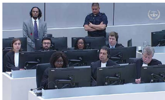
ICC judges find Mr Al Mahdi guilty of the war crime of attacking historic and religious buildings in Timbuktu, Mali

This provision does not encompass looting because movable cultural property, such as archaeological items or works of art, falls outside its scope. There are, however, two generic provisions concerning war crimes in non-international armed conflict: Article 8(2)(e)(v) prohibits “[p]illaging a town or place, even when taken by assault” and Article 8(2)(e)(xii) prohibits the destruction or seizure of “the property of an adversary unless such destruction or seizure be imperatively demanded by the necessities of the conflict”. These two provisions may apply to cultural objects.