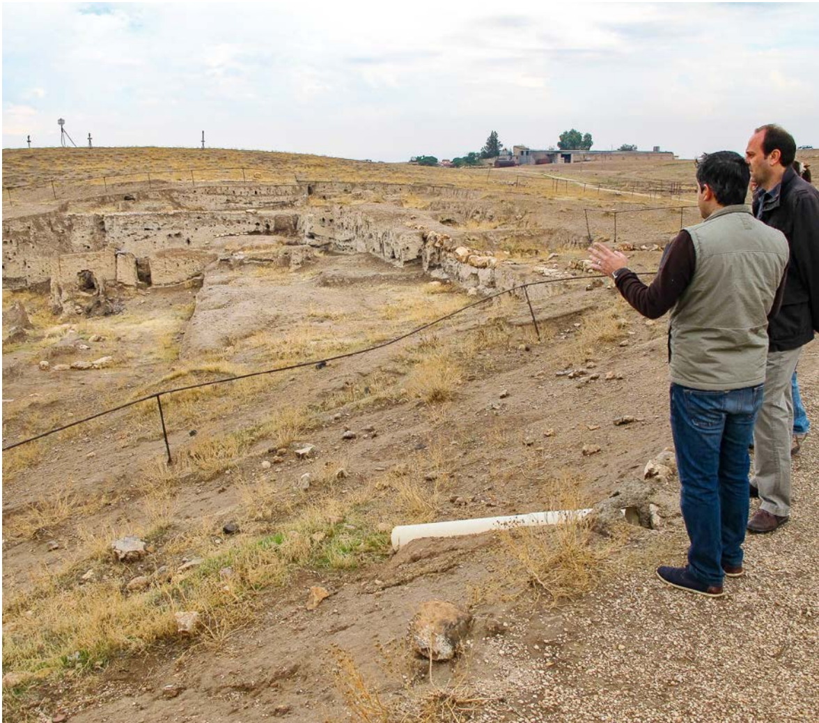
Geneva Call's team visits Urkesh archaeological site with members of the local "Authority of Tourism and Protection of Antiquities", near Amude, northeast Syria.

the content of the case studies and served as the basis for Chapter 3 on the engagement of ANSAs in the protection of cultural heritage in armed conflict. In addition, pilot training on the protection of cultural heritage was conducted on two occasions with Free Syrian Army (FSA) brigades, allowing Geneva Call to assess further the possibility of engaging with ANSAs through training on international legal standards.