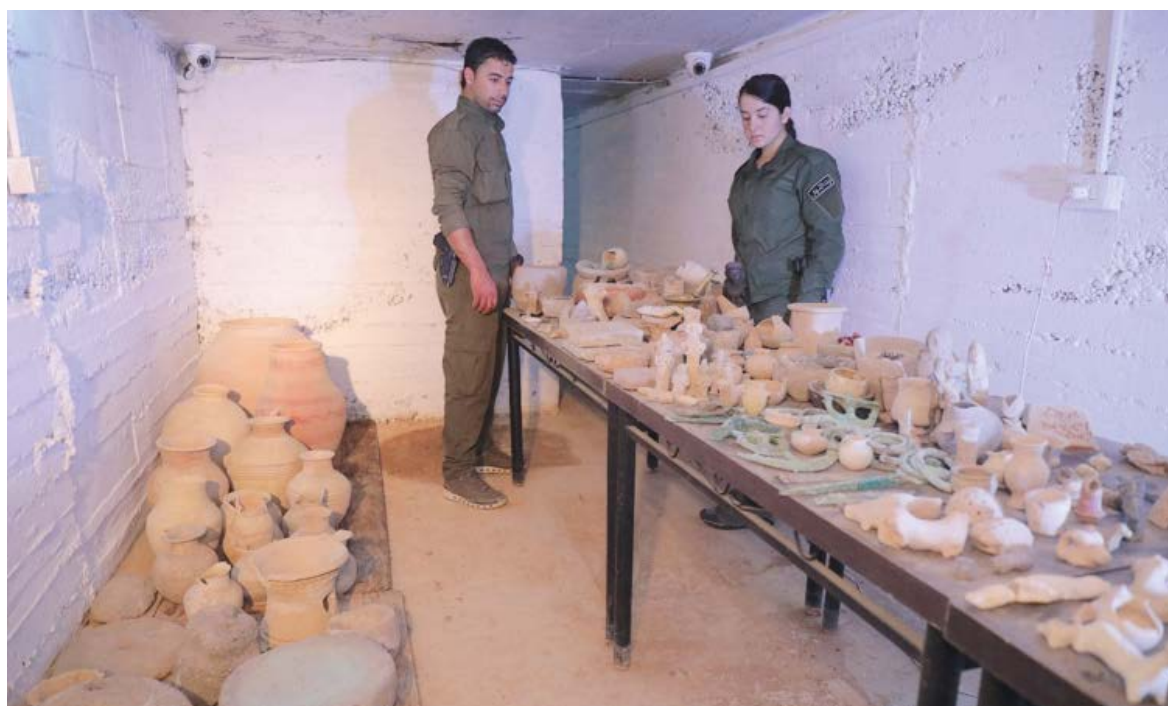
Cultural artifacts guarded by the Asayish police force in a special storage in northeast Syria

Similarly, in Iraq, the various militia groups active in Mount Sinjar have posted guards to protect Yezidi temples from attacks by Islamic State groups. 167 Several fighters of the Sinjar Resistance Units (YBS) were reportedly killed in 2015 while defending the shrine of Sheikh Hassan in Gabara. 168 The Popular Mobilization Forces (PMF) have claimed to have cleared