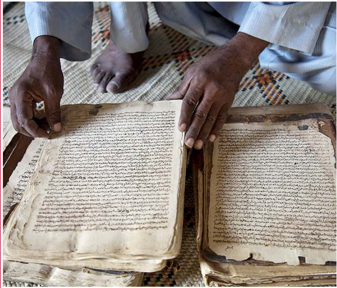
A manuscript from the 14th century, part of Mali's invaluable collection of ancient manuscripts