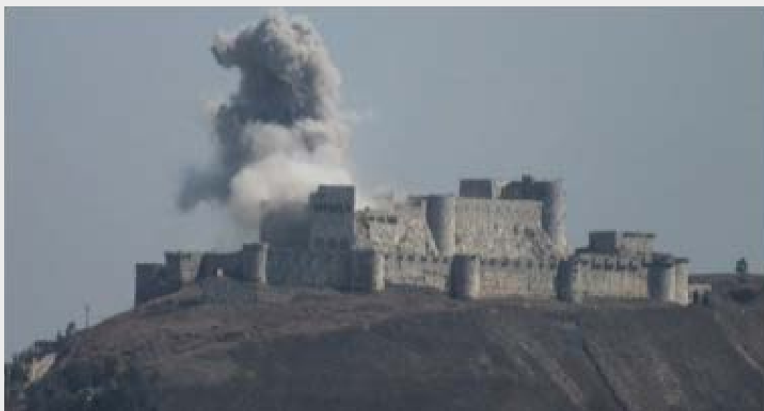
Crak des Chevaliers fortress blasted by air raid, Syria

The Syrian Antiquities Law explicitly adopts the doctrine of superior responsibility in Article 63: “ A penalty equal to that of the perpetrator is given to anyone whose legal responsibility is to protect antiquities or control the crimes mentioned in this Law, if they knew or were told of such crimes and failed to take the appropriate measures in order to control them. ” This could encompass the responsibility of ANSA commanders, since it can be established that they bear a legal responsibility (pursuant to Article 4(3) of the 1954 Hague Convention) to protect antiquities and control the crimes contained in the Syrian Antiquities Law.