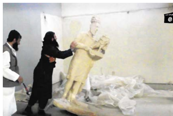
Members of the Islamic State group destroying ancient artefacts in the Mosul museum in Iraq

dollars.” 137 However, attacks on cultural heritage by the Islamic State group have not been limited to objects that bear a religious significance. For example, shortly after the raid on the Mosul Museum, the group destroyed the walls of Nimrud, the second capital of the ancient Assyrian empire, and its Northwest Palace. 138 The group also dynamited several temples of the ancient city of Palmyra, as well as the Arch of Triumph, the tetrapylon and part of the Roman theatre. 139