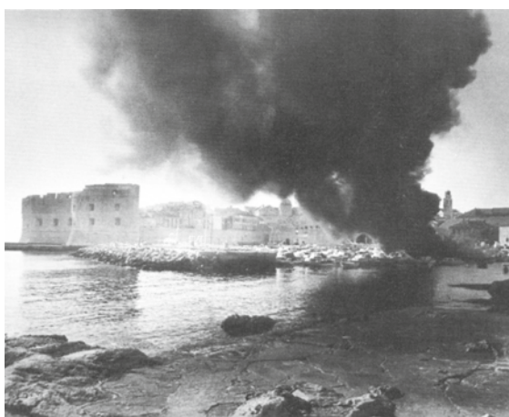
Mushroom of fire from an 1991 explosion on the main street of Dubrovnik