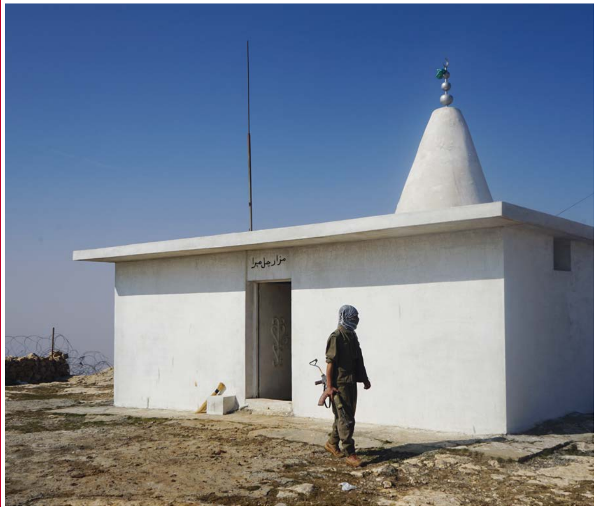
HPG/PKK fighter posing in front of Chermira temple in Sinjar, northwest Iraq