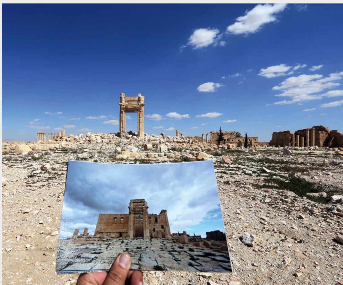
Palmyra's Temple of Bel, in Syria, against what remains after the Islamic State group left

they have deployed guards to protect cultural sites from plunder and have increased protection of the Umayyad mosque of Aleppo. 251 They declared that they had not received any specific training and were unaware of the international legal standards applicable to the protection of cultural heritage, although they demonstrated some knowledge of the general rules of IHL. To the question, “Have your brigades used cultural sites in their military operations?”, a FSA commander replied, speaking for his own brigade: “No [we do not use cultural sites for military purposes]. For example, we have freed the Temple in the Harem District (within the Idlib Governorate), and now we protect and guard it. We have never occupied a historical site.” 252