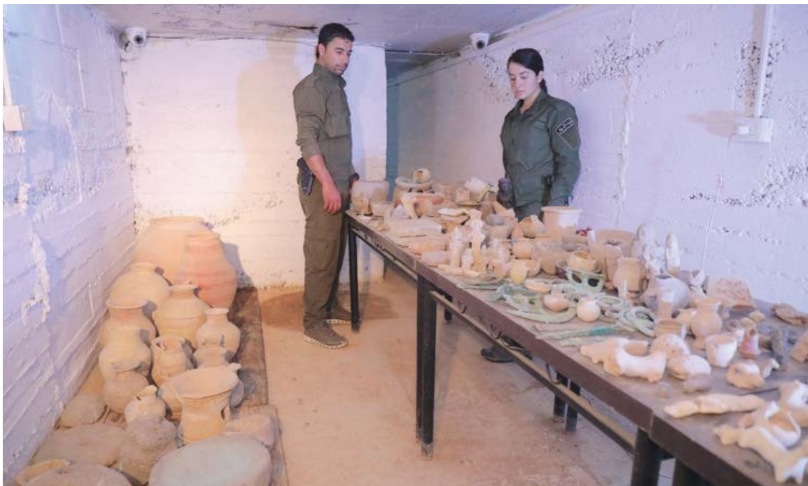
Cultural artifacts guarded by the Asayish police force in a special storage in northeast Syria

Similarly, in Iraq, the various militia groups active in Mount Sinjar have posted guards to protect Yezidi temples from attacks by Islamic State groups. 167 Several fighters of the Sinjar Resistance Units (YBS) were reportedly killed in 2015 while defending the shrine of Sheikh Hassan in Gabara. 168 The Popular Mobilization Forces (PMF) have claimed to have cleared